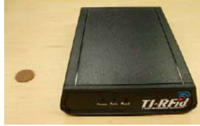
Figure 1 - RFID read- / writing device