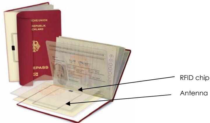
Figure 4 – German Passport

far only a picture of the passport holder and a security code is saved on the chip. However, having a capacity of 72 kB, it is designed to store further biometrical characteristics such as finger prints and iris scans in the near future. In addition to the large capacity, sophisticated security features are implemented.